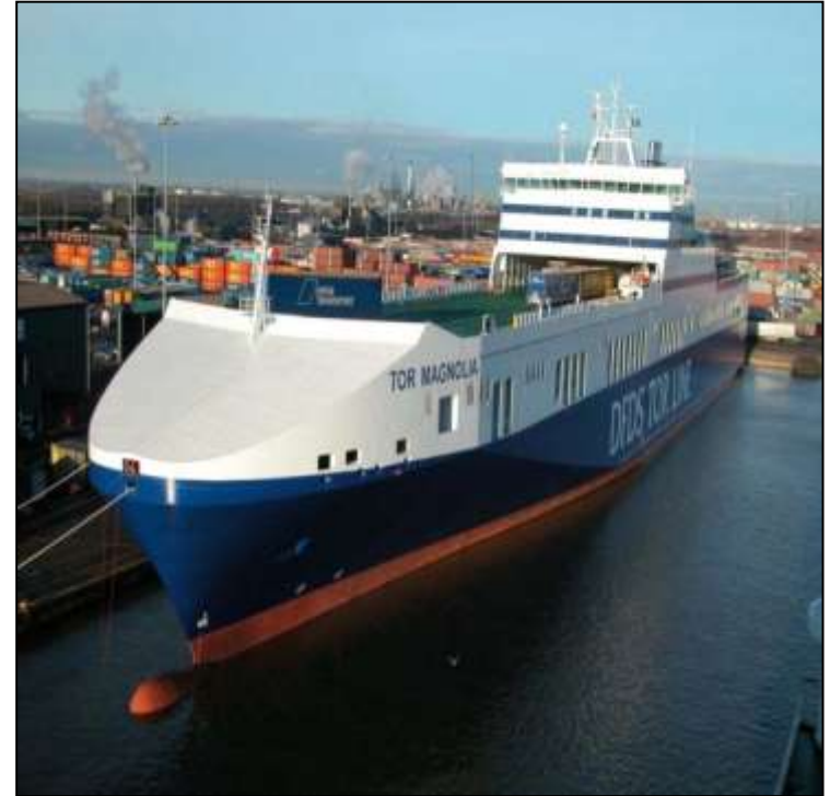
DFDS European network